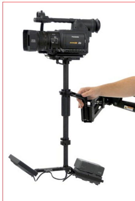
(ABOVE) The Flyer-LE with the Panasonic P2 camera complement each other perfectly.